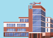
Disproportionate Share Hospitals (hospitals serving a high percentage of Medicaid patients)